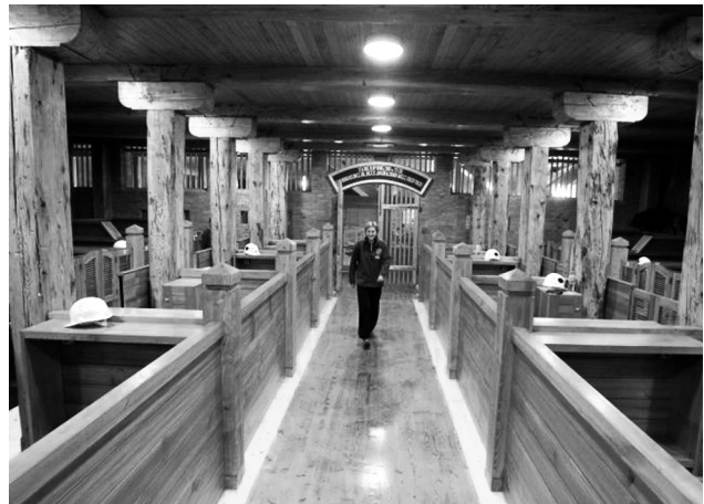
Fig. 2. Wieliczka Salt Mine (Poland)